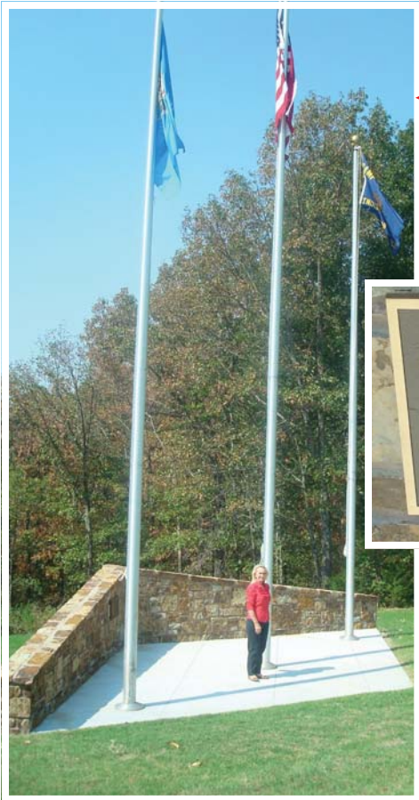
The Judy Smith Eagle Scout Class of 2008 Flag Plaza and commemorative plaque