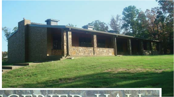
Siegfried Hall : (Top) A view of the covered back porch (Middle) Siegfried Hall Sign (Bottom) Front view of Siegfried Hall

A bonus for the weekend was the dedication ceremony of all the new facilities at the camp. The dedication ceremony recognized some of the major contributors that made the improvements to the Mabee Scout Reservation possible. Dedications were made of the Mabee Scout Reservation, Siegfried Hall, Judy Smith Flag Plaza, Podpechan Park, and the Babbit Chapel. Thank you to everyone who contributed, because the improvements that have been made using these funds not only honor the past, but will benefit all the Scouters in Indian Nations Council in the future.